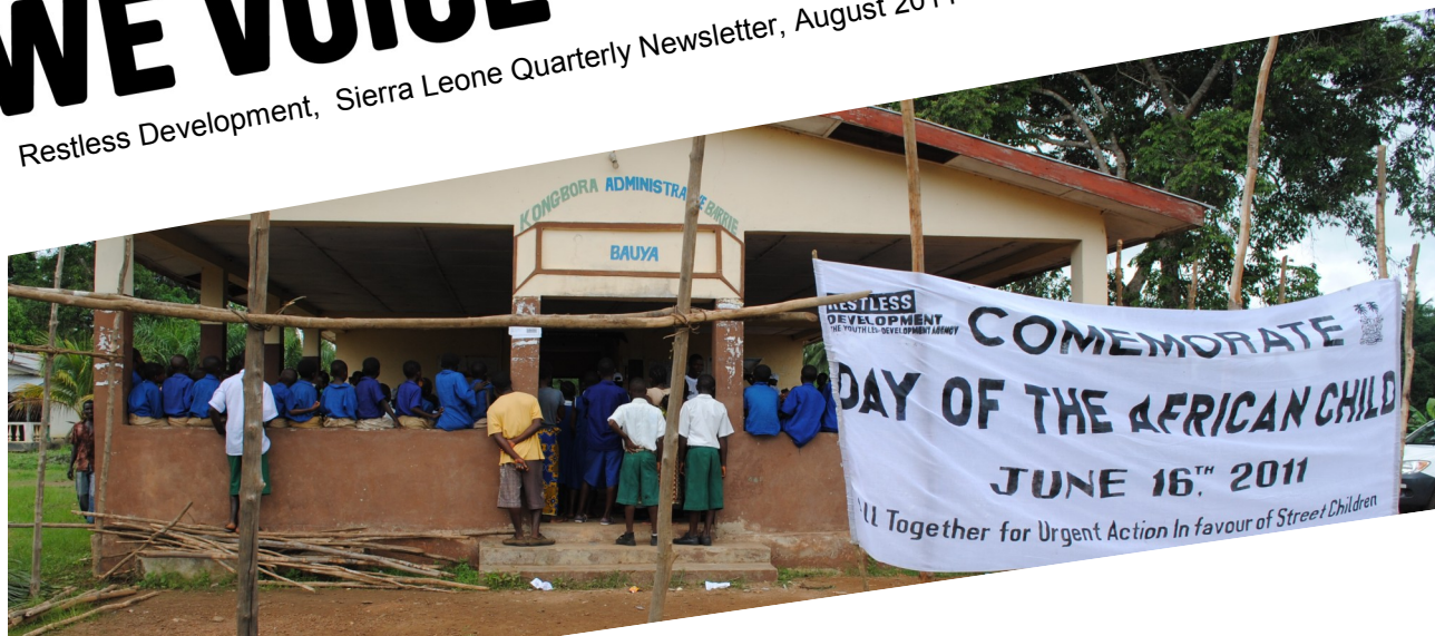
Day of the African Child celebrations In Moyamba District

Restless Development, Sierra Leone Quarterly Newsletter, August 2011