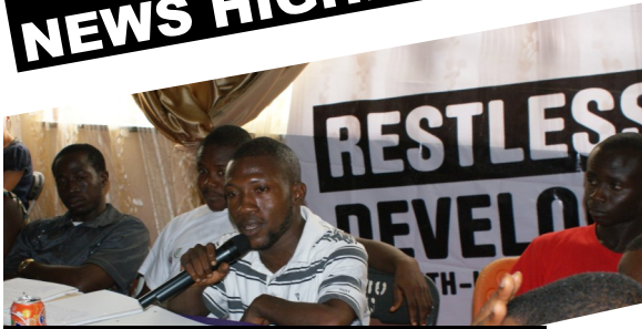
Young Leaders have their voices heard at the Youth Dialogue Forum