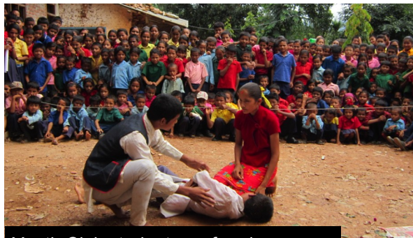
Youth Club students performing an awareness drama

“Both the STARS assessment team and the independent Panel were impressed by the innovative way in which Restless Development in Nepal has used international, national and local volunteers to deliver projects and provide peer to peer education.”