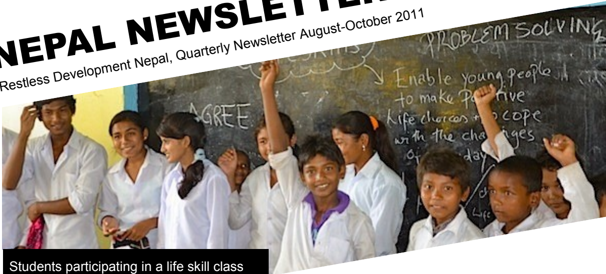
Students participating in a life skill class