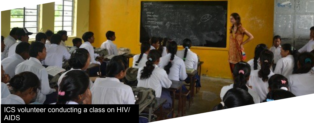
ICS volunteer conducting a class on HIV/AIDS